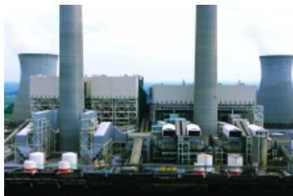
1. Plant Bowen. Georgia Power's Plant Bowen in Cartersville has teamed up with Clyde Bergemann Inc. to fight slag with new sensors called SmartGauges.

The “smart” sensor system modernizes traditional sootblower operation by eliminating or curtailing the use of ineffective blowers and by indicating areas where additional blowing is required. Early tests showed, according to Breeding, “a dramatic reduction in the amount of steam used for sootblowing and a delay in the plugging up of the boiler. The system not only decreases the