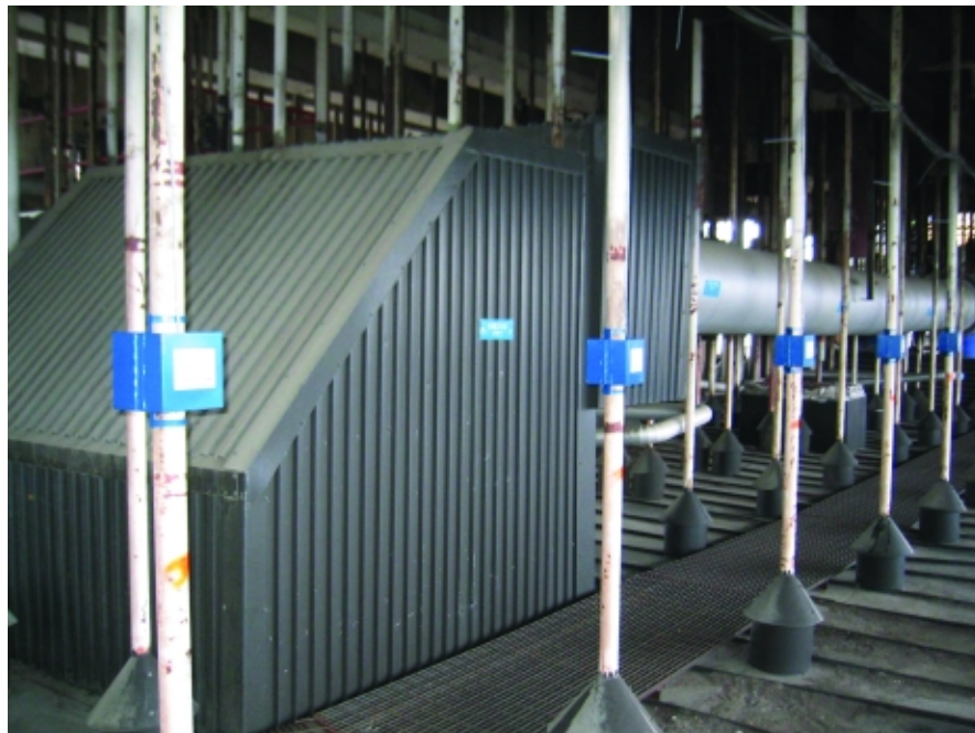
2. Sensors. SmartGauges installed on rods between the pendant heat exchange surfaces (left) detect increased weight from slag buildup. The amplifier cabinet (right) collects and conditions the sensors' signals and sends their data on to the control room.